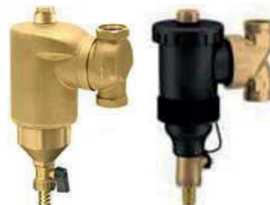
Product group 83