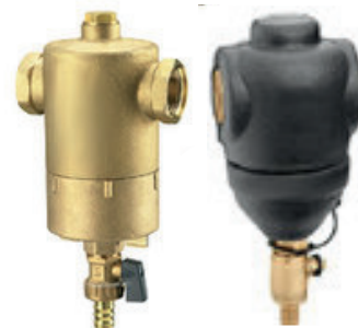
Product group 83