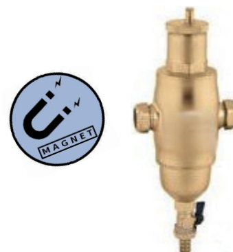
Product group 83