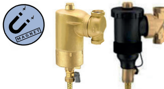
Product group 83