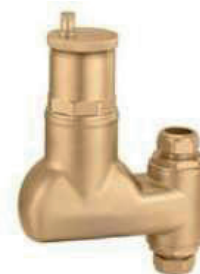
Product group 84