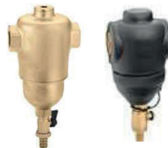
Product group 83